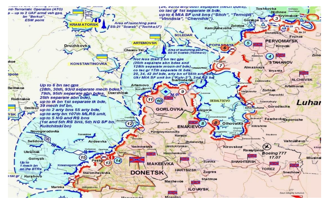
Figure No. 2. The Debaltseve Pocket<sup>23</sup>

Late in January, Russia's hybrid occupation forces launched an offensive on the Debaltsevo bridgehead, trying to surround and destroy the Ukrainian troops located there. For this purpose, the enemy concentrated significant forces of the Russian Federation's regular troops and the most combat-ready illegal armed formations of self-proclaimed "republics" (see Figure No. 2 ). The strength of enemy troops reached 7-9 thousand people, supported by up to 120 tanks, 180 artillery systems, 60 multiple launch rocket systems.<sup>22</sup>