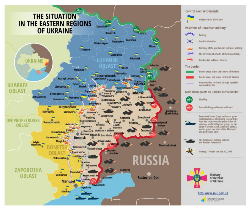
Figure No. 3. The situation in the Eastern Regions of Ukraine in September 2015 (from the daily official report on MOD website)<sup>31</sup>

Ukraine in the eastern region. Numerous facts of issuing Russian passports to Ukrainian citizens living in the occupied territories reinforce Russian aggression's hybrid nature.<sup>30</sup>